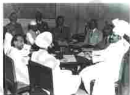
Members of the Constituent Assembly feared that the executive might become too strong and ignore its responsibility to the legislature. The Assembly, therefore, included a number of provisions in the Constitution to limit and control the action taken by the executive branch of government as a whole.

The word 'State' is often used in this chapter. This does NOT refer to state governments. Rather when we use State, we are trying to distinguish it from 'government'. 'Government' is responsible for administering and enforcing laws. The government can change with elections. The State on the other hand refers to a political institution that represents a sovereign people who occupy a definite territory. We can, thus, speak of the Indian State, the Nepali State etc. The Indian State has a democratic form of government. The government (or the executive) is one part of the State. The State refers to more than just the government and cannot be used interchangeably with it.