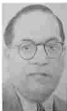
Baba Saheb Dr Ambedkar is known as the Father of the Indian Constitution.

The vast number of communities in India meant that a system of government needed to be devised that did not involve only persons sitting in the capital city of New Delhi and making